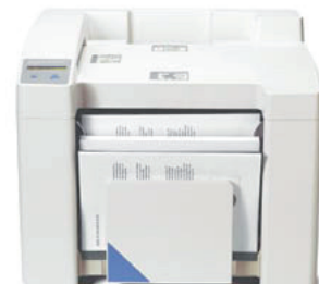
Model 101 DFS