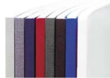
Bindomatic Aquarelle covers are available in grey, graphite, dark blue, burgundy, dark green, black, blue or white.