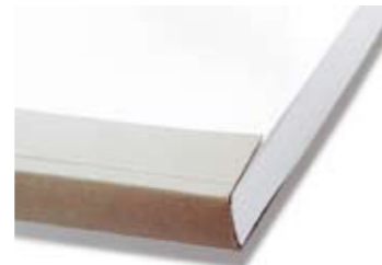
When you use a Bindomatic cover, the paper edges are as even as in a book.

For your premium documents. The exclusive Bindomatic hard cover in leather texture with inner cover in matching colour. Simply print your artwork on the self-adhesive front label included and create that unique cover of your own.