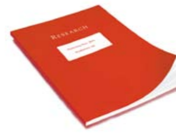
A one-colour, bleed print, customised corporate cover with die-cut window.

...or a cover which has been specially designed to reflect your corporate profile?