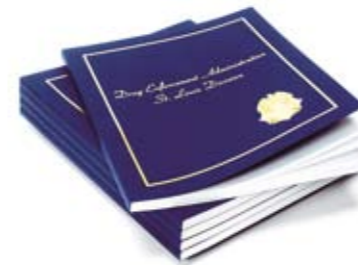
A company's logotype and colours should also be reflected in documentation produced in-house.