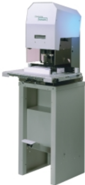
NAGEL CITOBORMA 290 B with treadle.

The standard version of the Citoborma 190 and 290 comes as a table top model. They are available with one spindle, two fixed spindles or two spindles with variable distance for any combination of holes to be drilled.