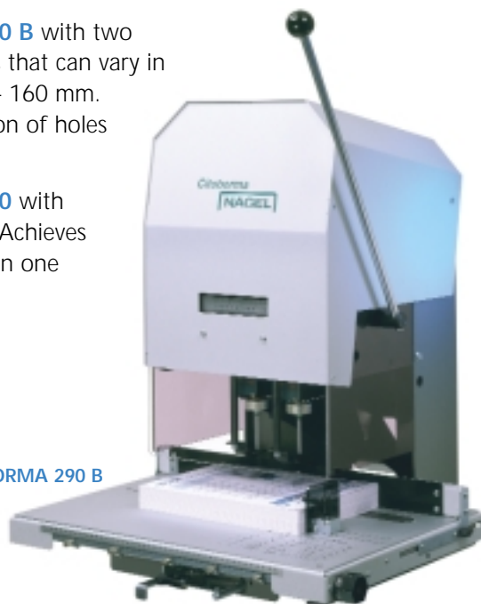
NAGEL CITOBORMA 290 B table top.