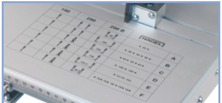
Preprogrammed hole patterns: Set-up within a second.