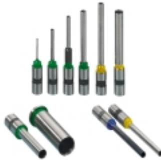
NAGEL drill bits: 2 – 35 mm diameter; 50 – 60 mm cutting length; options for special applications.