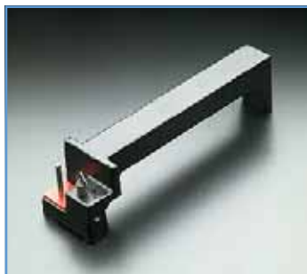
NAGEL drill bit sharpener for quick on-site resharpening.