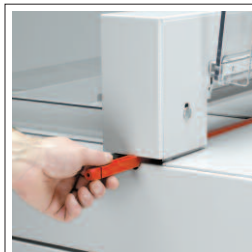
EASY CUTTING STICK CHANGE