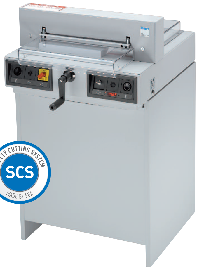
EBA 436 A with optional cabinet