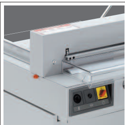
BLADE CHANGING DEVICE