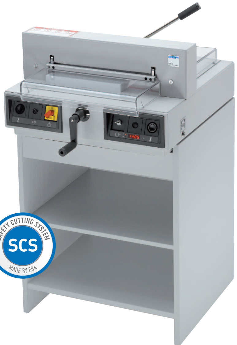
EBA 436 E with optional cabinet