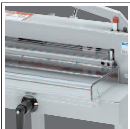
FRONT HAND GUARD