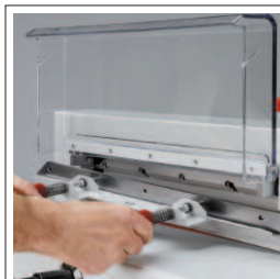
BLADE CHANGING DEVICE