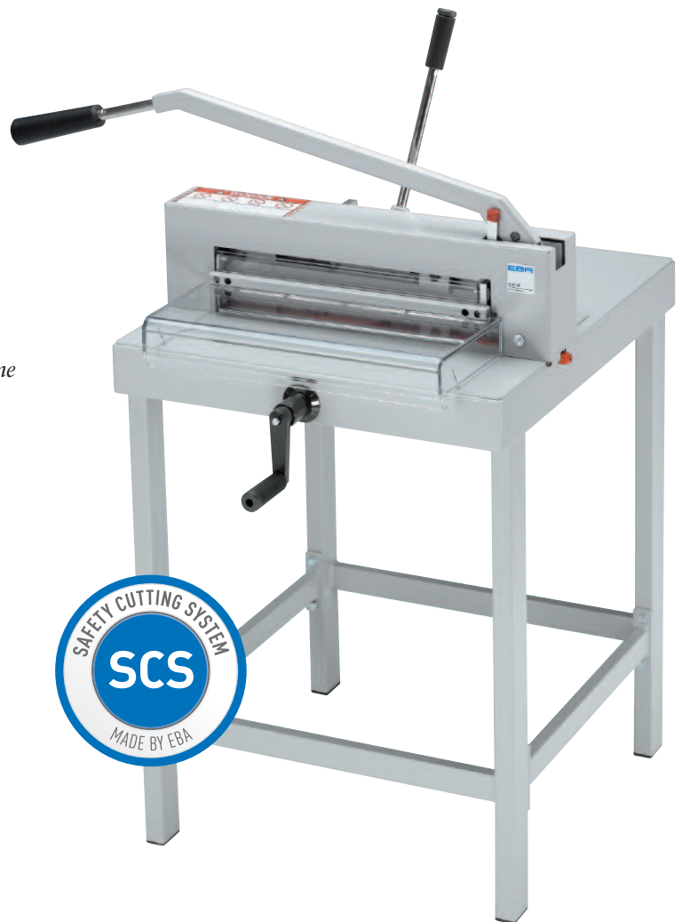
EBA 436 M with optional stand