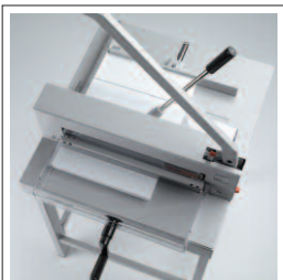
FRONT HAND GUARD