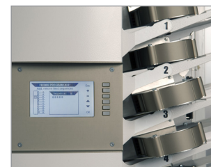
ACF 510 display and fan