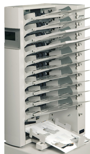
C 510 without air separation

Unlike all other friction feed systems on the market, Morgana's new 510 AC/ACF models offer a unique air separation system. Each bin has fans blowing air into the stack from two sides that radically improves the feeding of statically charged or normally hard to feed stock. The air separation in the 510 Series sets new standard in feeding, ideal for digitally printed media.