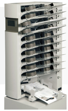
AC 510 with air separation

High capacity user friendly range of feeders & collators for digital and litho printed applications.