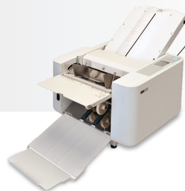
Table top paper folder